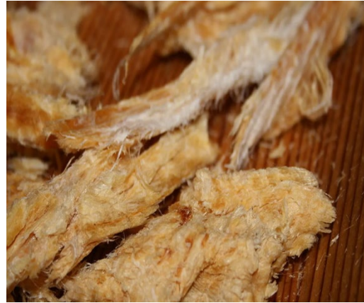
Fish Jerky 魚乾