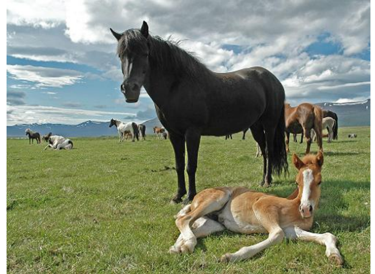
Icelandic Horses 冰島馬