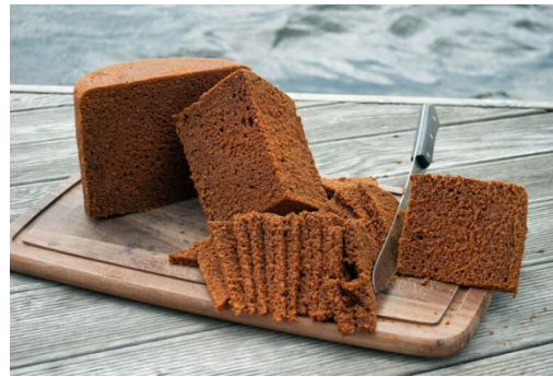
Hot spring rye bread 溫泉黑麥麵包