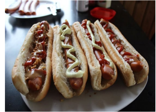
Hot dog 熱狗