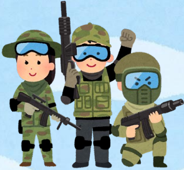
Survival game 生存遊戲