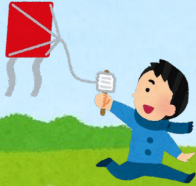
Kite Boarding 放風箏