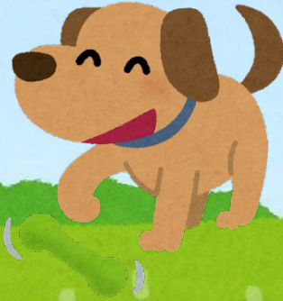
Dog walking 遛狗