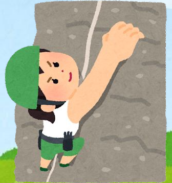
Rock Climbing 攀岩